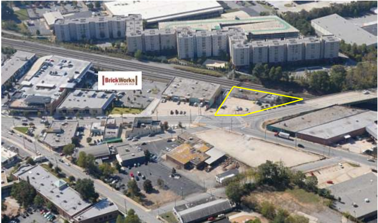
Midtown West Area at the intersection of Howell Mill Road and Marietta Street